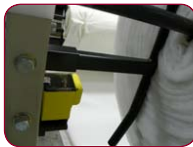
Wireless, remote material run-out sensors. No cords, no tangles, no problem!