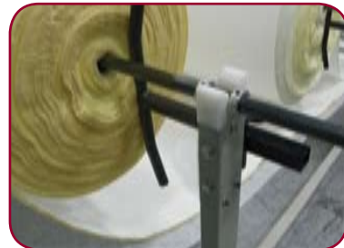
No tools necessary for these Quick-set Paddle Brakes. Easy hand adjustments keep your production moving.

New Gribetz Preventative Maintenance software can help you keep your machine properly maintained for optimized productivity and extend the life of your machine.