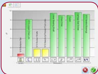
Visual charts to track and alert you of maintenance status.