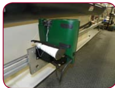
Sturdy new bag closer rail system. Splice materials quickly and efficiently.