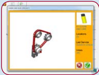
Informative guides on the machine for maintenance operations.