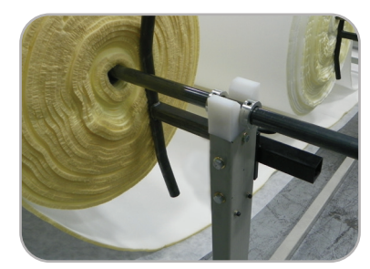
No tools necessary for Quick-set Paddle Brakes – easy hand adjustments keep your production moving.