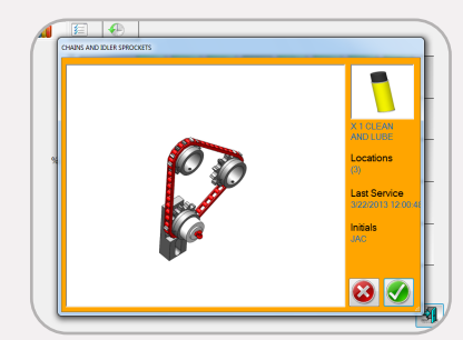
Informative guides on the machine for maintenance operations.