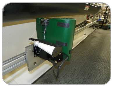
Sturdy new bag closer rail system splices materials quickly and efficiently.