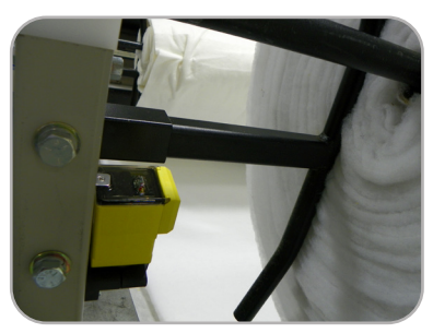
Wireless, remote material run-out sensors – no cords or tangles.

Global Systems Group<sup>®</sup> (GSG) is a collection of the world's leading mattress machinery companies. These GSG machinery companies represent leadingedge technology in computerized quilting machines and panel cutters, automated and conventional sewing machines, material handling solutions, and mattress-packaging equipment.