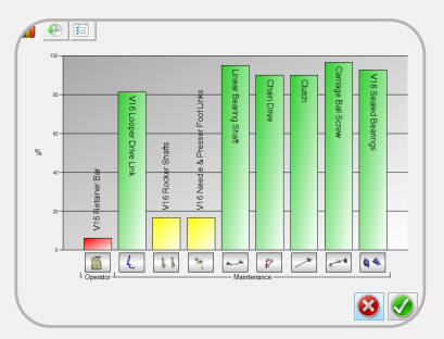
Visual charts to track and alert you of maintenance status.

Language-independent icons for maintenance tasks.