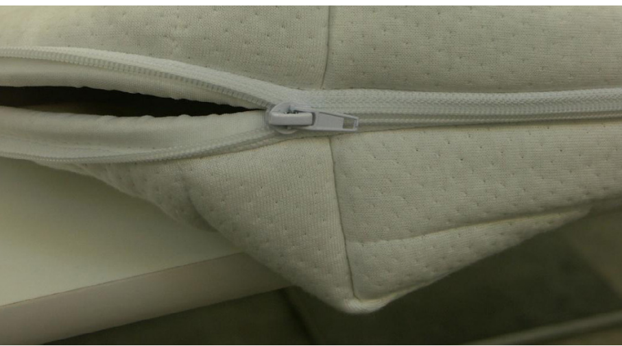
The NC-1199-1 long-arm zipper-sewing station is the perfect solution for simultaneously attaching zipper halves to mattress top and bottom panels.